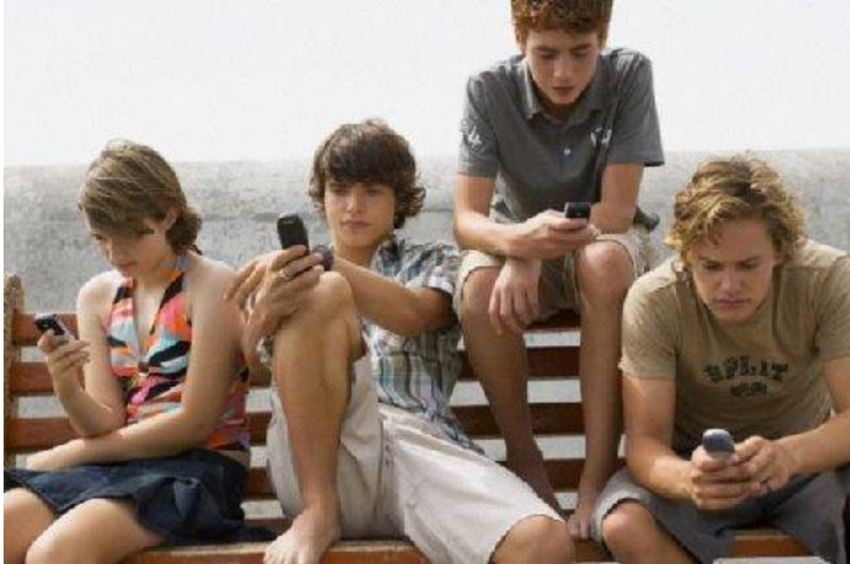
A day at the beach.