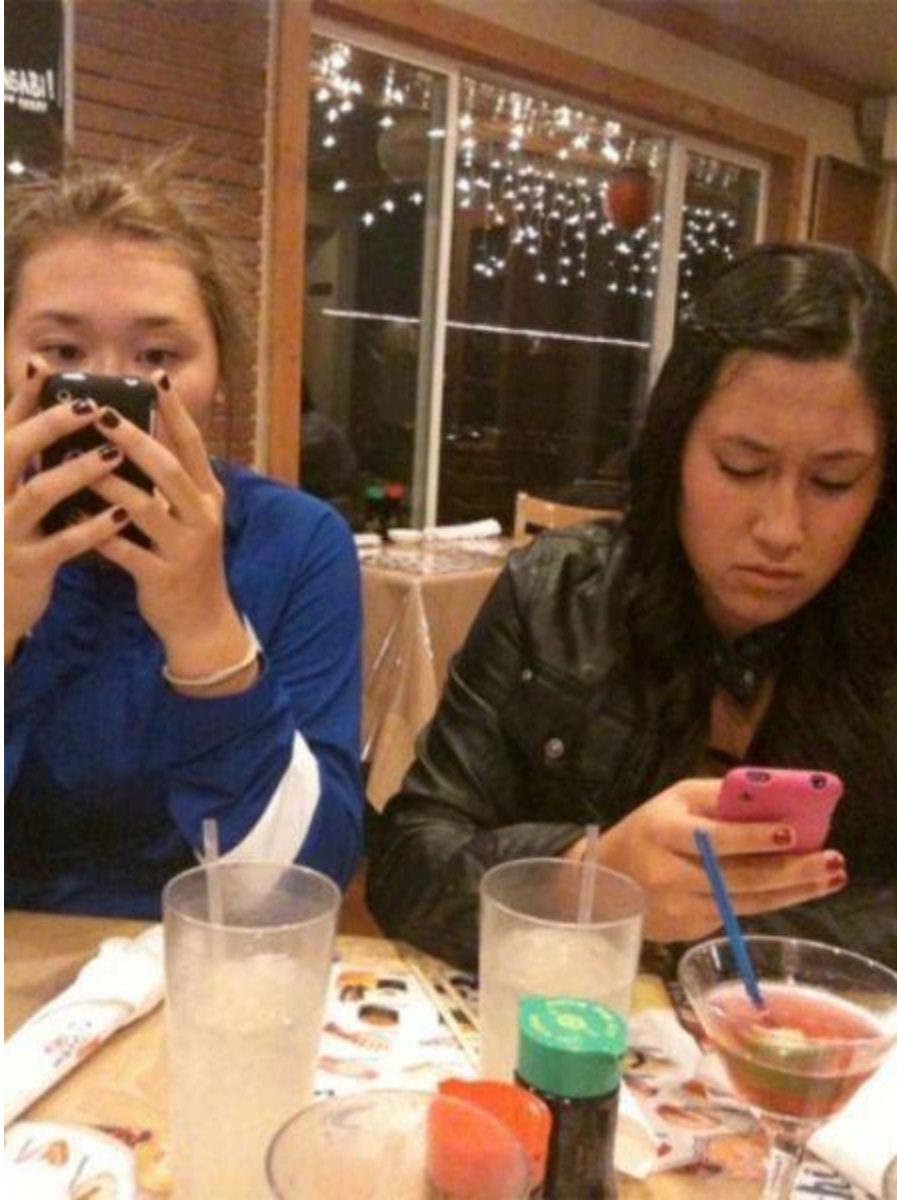
Having a conversation with your bestie