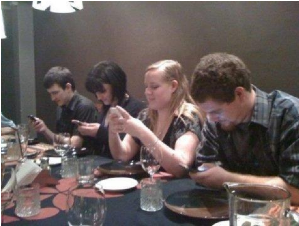
Having dinner out with your friends.