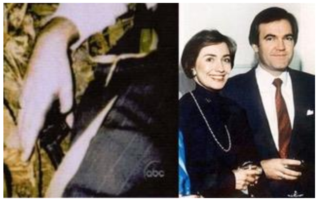
Was it the Vince Foster murder?

Was it the Gennifer Flowers assault & settlement?