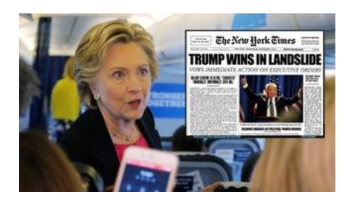
Was it the Russian Uranium Deal?