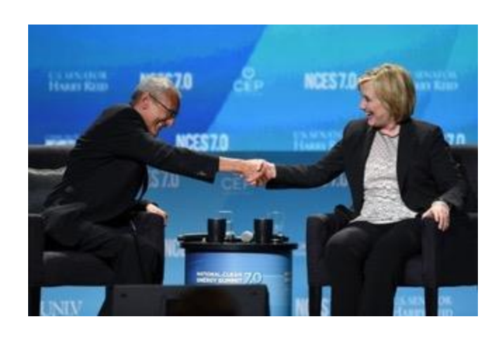
Was it Comey?