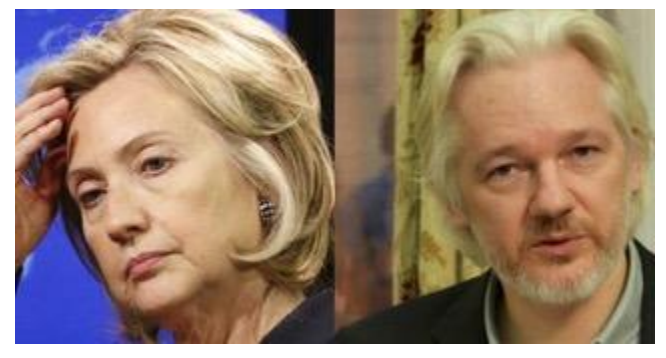
Was it Podesta?