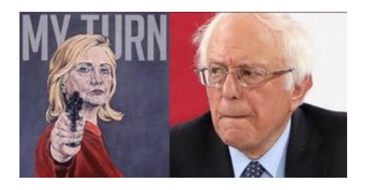
Was it Bill's impeachment?