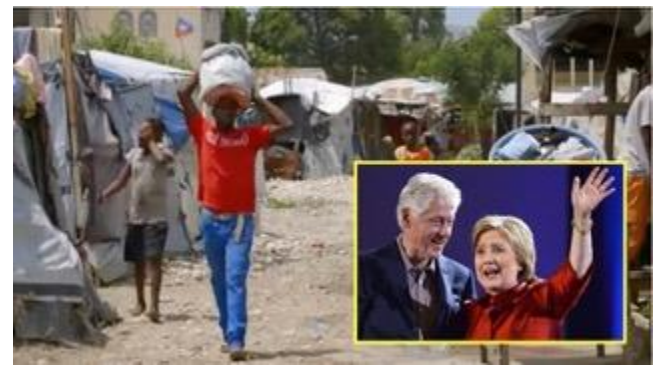
Was it subpoena violations?

Was it the congressional testimony lies?