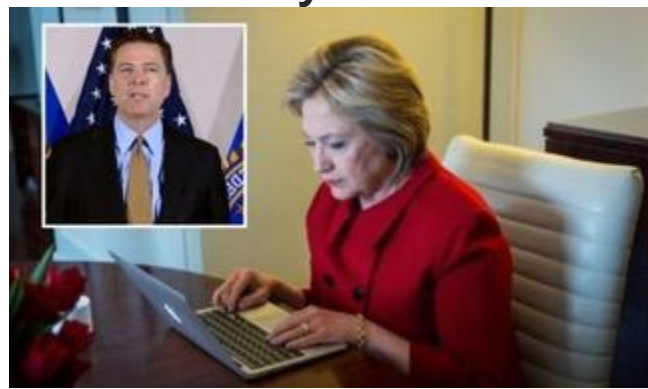
Was it having a sexual predator as a husband?