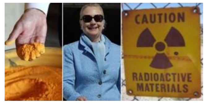
Was it Wikileaks?