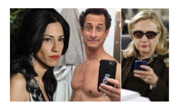
Was it because the Clinton Foundation ripped off Haiti?