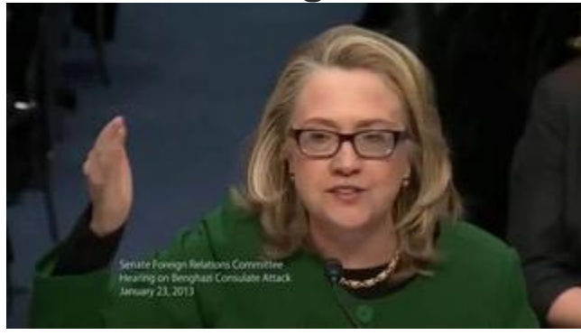
Was it the corrupt Clinton Foundation?

Was it the congressional testimony lies?