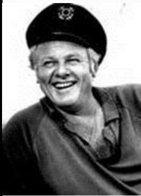
Alan Hale Jr, US Coast Guard.