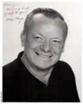
Aldo Ray. US Navy. UDT frogman, Okinawa.