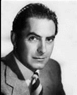
Tyrone Power, US Marines. Transport pilot in the Pacific Theater.