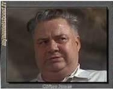
Clifton James, US Army, South Pacific. Was awarded the Silver Star, Bronze Star, and Purple Heart.