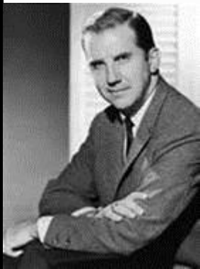
Ed McMahon, US Marines. Fighter Pilot. (Flew OE-1 Bird Dogs over Korea as well.)