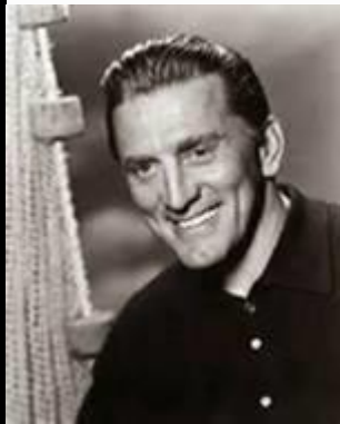
Kirk Douglas, US Navy. Sub-chaser in the Pacific. Wounded in action and medically discharged.