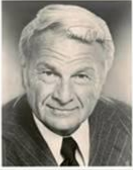
Eddie Albert, US Coast Guard. Bronze Star with Combat V for saving several Marines under heavy fire as pilot of a landing craft during the invasion of Tarawa.