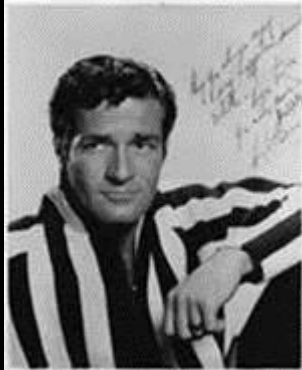
Hugh O'Brian, US Marines.