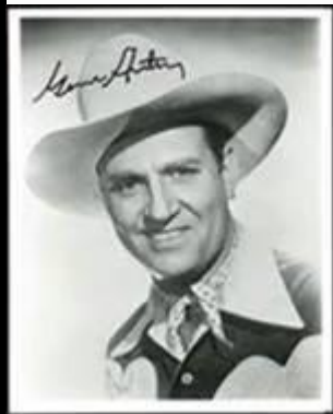
Gene Autry, US Army Air Corps. Crewman on transports that ferried supplies over "The Hump" in the China-Burma-India Theater.