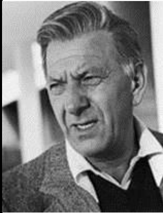
Jack Klugman, US Army.