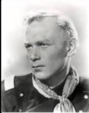
Harry Carey Jr., US Navy.