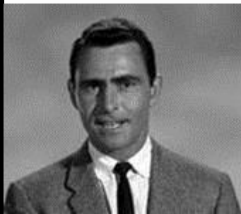
Rod Serling. US Army. 11th Airborne Division in the Pacific. He jumped at Tagaytay in the Philippines and was later wounded in Manila.