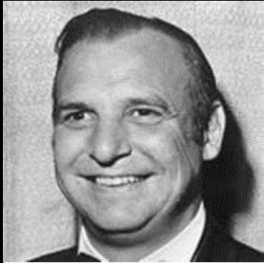
Jackie Coogan, US Army Air Corps. Volunteered for gliders and flew troops and materials into Burma behind enemy lines.