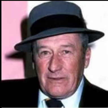
Mickey Spillane, US Army Air Corps, Fighter Pilot and later Instructor Pilot.