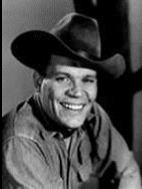
Neville Brand, US Army, Europe. Was awarded the Silver Star and Purple Heart.