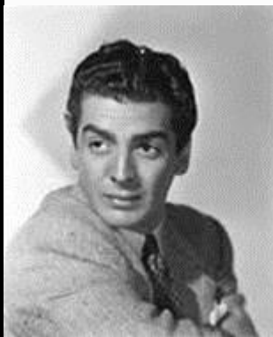
Victor Mature, US Coast Guard.