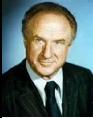
Jack Warden, US Navy, 1938-1942, then US Army, 1942-1945. 101st Airborne Division.