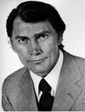
Jack Palance, US Army Air Corps. Severely injured bailing out of a burning B-24 bomber.