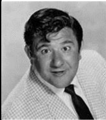
Buddy Hackett, US Army anti-aircraft gunner.