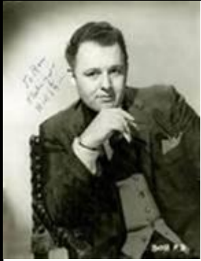
Rod Steiger, US Navy. Was aboard one of the ships that launched the Doolittle Raid.