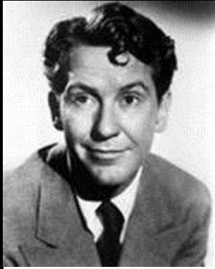
Burgess Meredith, US Army Air Corps.