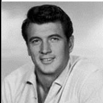
Rock Hudson, US Navy. Aircraft mechanic, the Philippines.