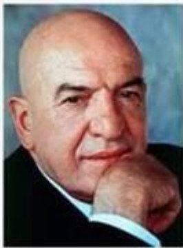
Telly Savalas, US Army.