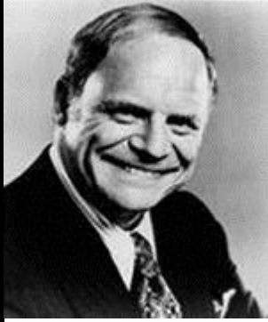
Don Rickles, US Navy aboard USS Cyrene.