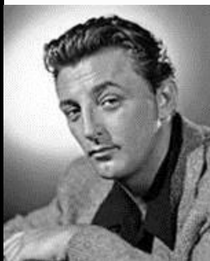
Robert Mitchum, US Army.