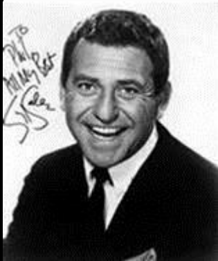
Soupy Sales, US Navy. Served on USS Randall in the South Pacific.