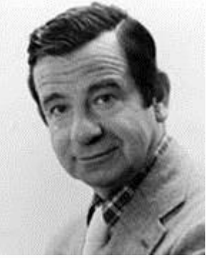
Walter Matthau, US Army Air Corps., B-24 Radioman/Gunner and cryptographer.