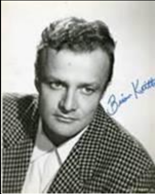
Brian Keith, US Marines. Radioman/Gunner in Dauntless dive-bombers.