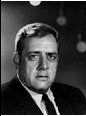
Raymond Burr, US Navy. Shot in the stomach on Okinawa and medically discharged.