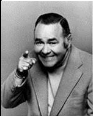
Jonathan Winters, USMC. Battleship USS Wisconsin and Carrier USS Bon Homme Richard. Anti-aircraft gunner, Battle of Okinawa.