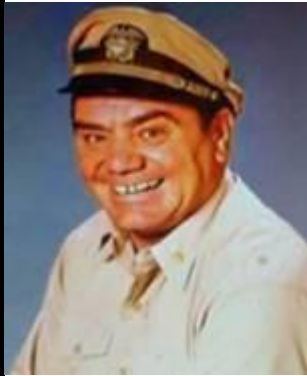
Ernest Borgnine, US Navy. Gunners Mate 1c, destroyer USS Lambertson.