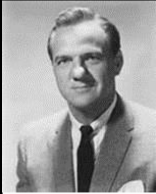
Karl Malden, US Army Air Corps. 8th Air Force, NCO.