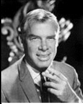
Lee Marvin US Marines. Sniper. Wounded in action on Saipan. Buried in Arlington National Cemetery, Sec. 7A next to Greg Boyington and Joe Louis.