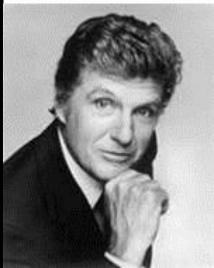
Robert Stack, US Navy. Gunnery Officer.