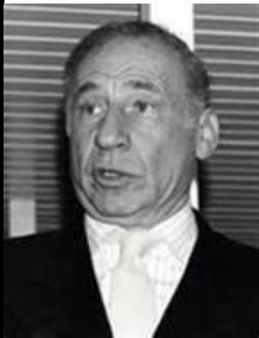
Mel Brooks, US Army. Combat Engineer. Saw action in the Battle of the Bulge.