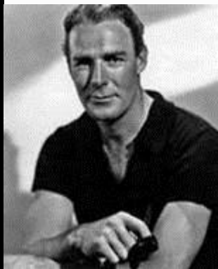
Randolph Scott. Tried to enlist in the Marines but was rejected due to injuries sustained in US Army, World War 1.