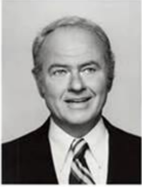
Harvey Korman, US Navy.