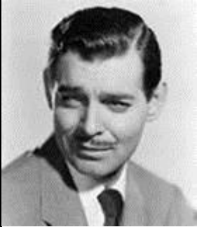
Clark Gable, US Army Air Corps. B-17 gunner over Europe.