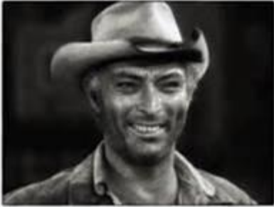
Lee Van Cleef, US Navy. Served aboard a sub chaser then a mine sweeper.