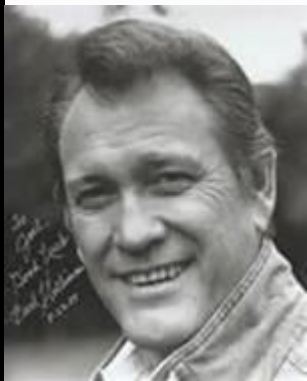
Earl Holliman. US Navy. Lied about his age to enlist. Discharged after a year when they Navy found out.