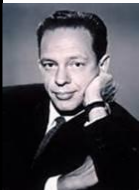
Don Knotts, US Army, Pacific Theater.