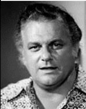
Charles Durning. US Army. Landed at Normandy on D-Day. Shot multiple times. Awarded the Silver Star and Bronze Star and three Purple Hearts. Survived Malmedy Massacre.