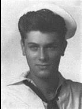
Tony Curtis, US Navy. Sub tender USS Proteus. In Tokyo Bay for the surrender of Japan.