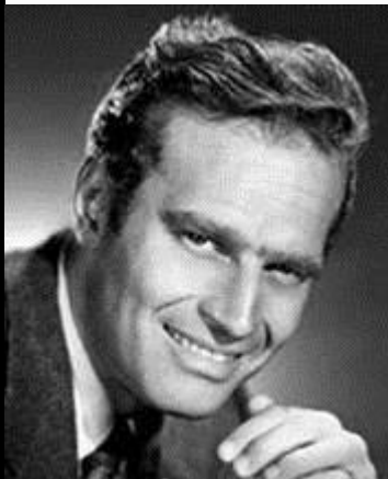
Charlton Heston, US Army Air Corps. Radio operator and aerial gunner on a B-25, Aleutians.