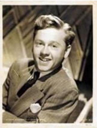
Mickey Rooney, US Army under Patton. Bronze Star.