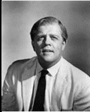
Pat Hingle, US Navy. Destroyer USS Marshall