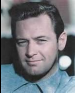
William Holden, US Army Air Corps.