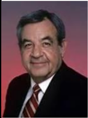
Tom Bosley, US Navy.