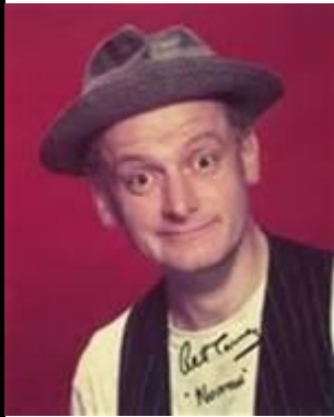
Art Carney, US Army. Wounded on Normandy beach, D-Day. Limped for the rest of his life.