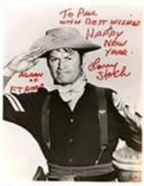
Larry Storch. US Navy. Sub tender USS Proteus with Tony Curtis.