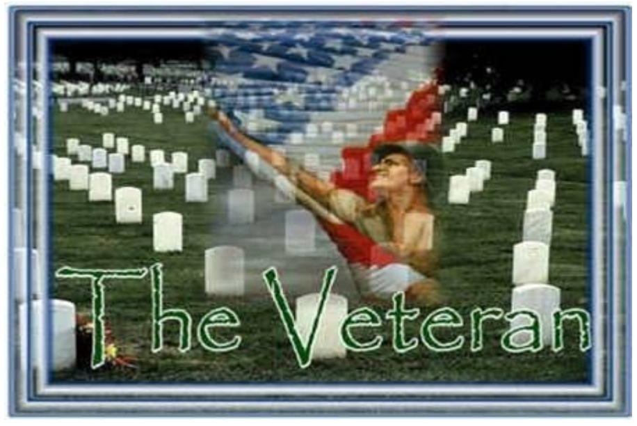
I thought about a graveyard At the bottom of the sea. Of unmarked graves in Arlington. NO FREEDOM ISN'T FREE