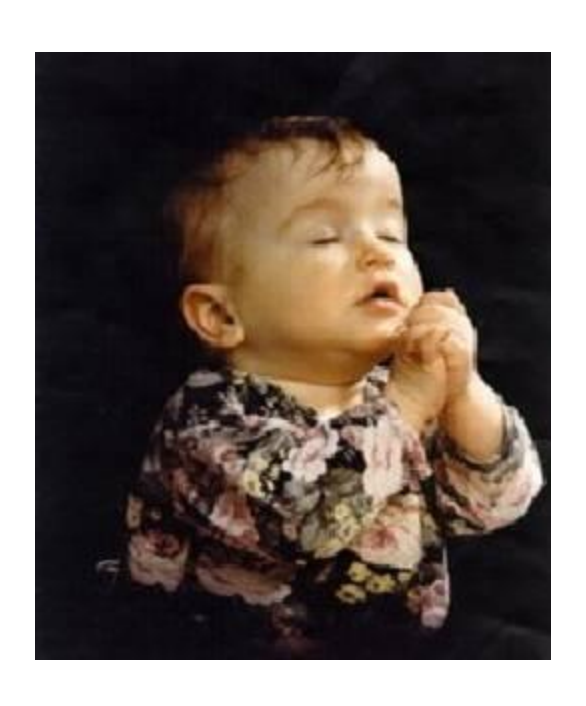
I thought of all the children, of the mothers and the wives, of fathers, sons and husbands With interrupted lives.