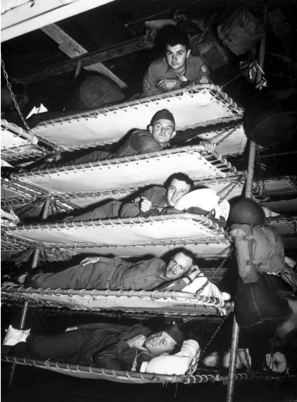
Bunks aboard the Army transport SS Pennant .

The Navy wasn't picky, though: cruisers, battleships, hospital ships, even LSTs (Landing Ship, Tank) were packed full of men yearning for home.