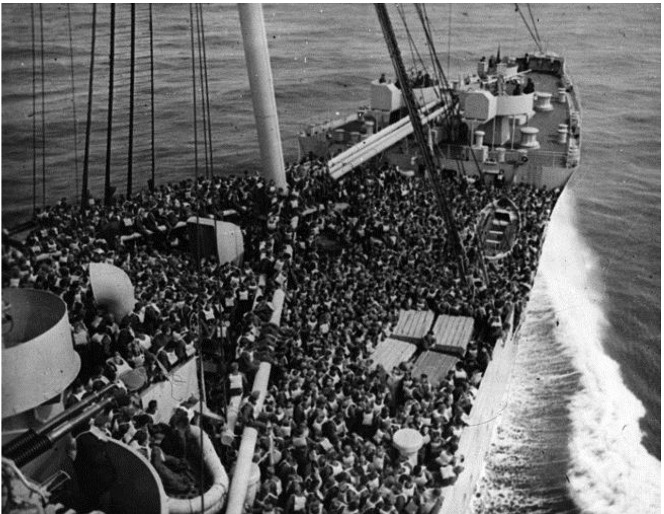
Troops performing a lifeboat drill onboard the Queen Mary in December 1944, before Operation Magic Carpet .

Twenty-nine ships were dedicated to transporting war brides: women married to American soldiers during the war.