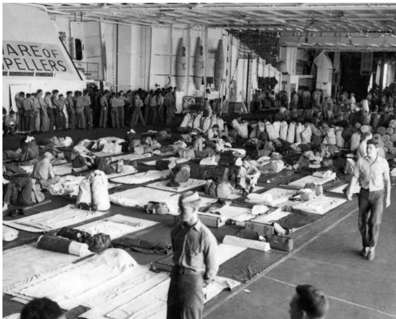
Hangar of the USS Wasp during the operation.

There was enormous pressure on the operation to bring home as many men as possible by Christmas 1945.