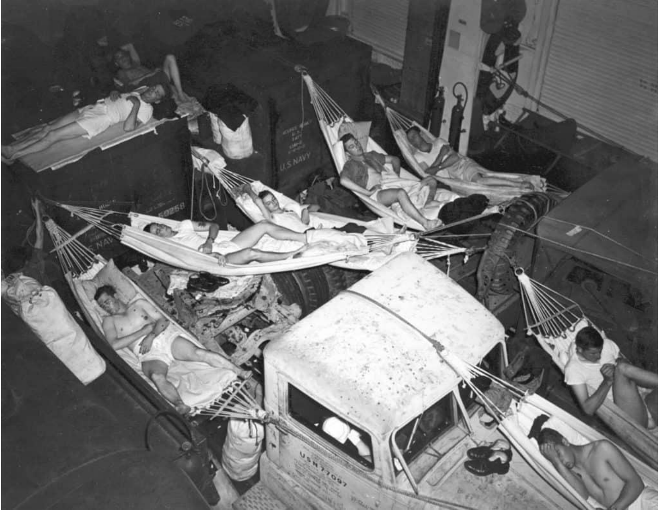
Hammocks crammed into available spaces aboard the USS Intrepid . In October 1945, with the war in Asia also over, the Navy started chipping in, converting all available vessels to transport duty.

On smaller ships like destroyers, capable of carrying perhaps 300 men, soldiers were told to hang their hammocks in whatever nook and cranny they could find.