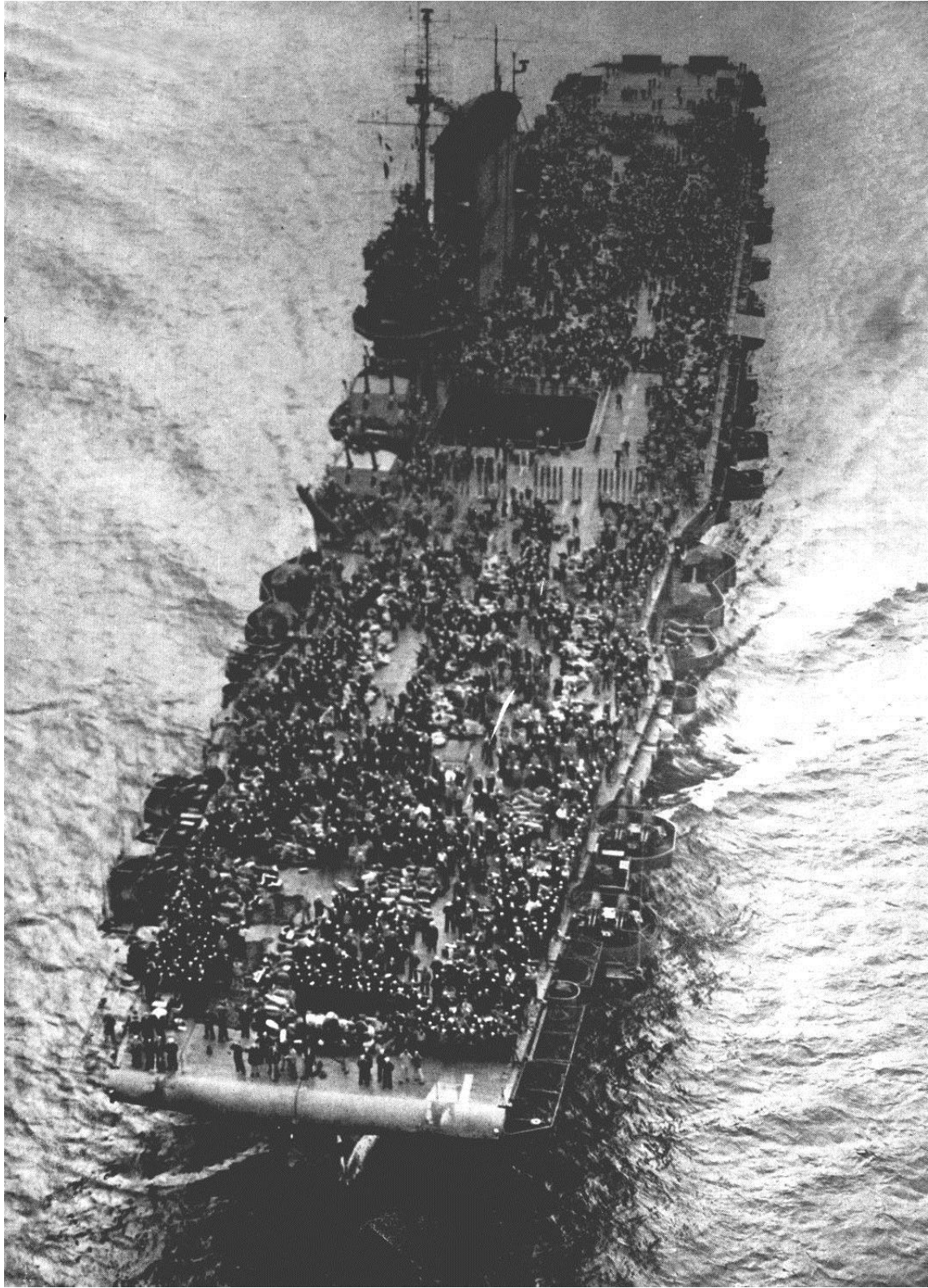
The crowded flight deck of the USS Saratoga .

The USS Saratoga transported home a total of 29,204 servicemen during Operation Magic Carpet , more than any other ship. Many freshly discharged men found themselves stuck in separation centers but faced an outpouring of love and