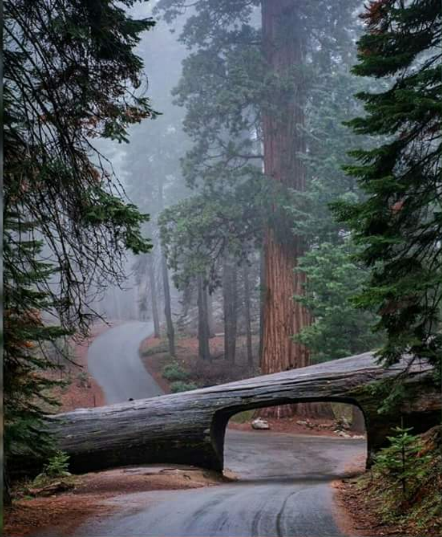
A giant Log you can drive through in Sequoia National Park, California. Weird World