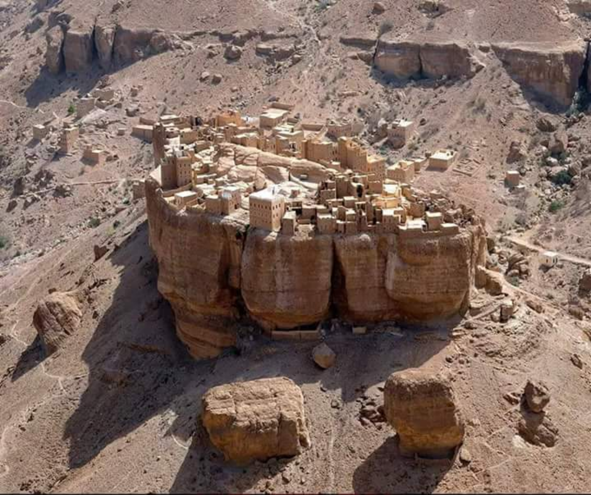
A village in Yemen.