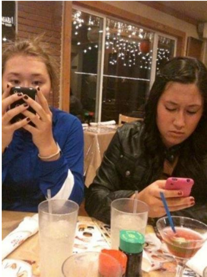
Having a conversation with your bestie.