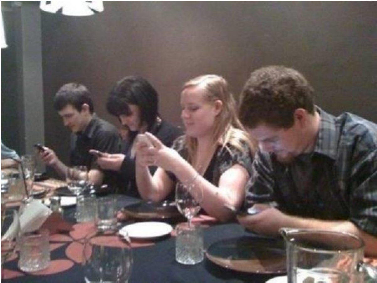
Having dinner out with your friends