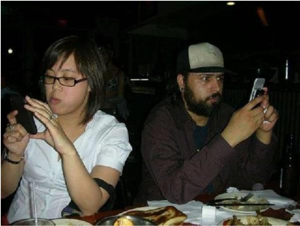
Out on an intimate date.