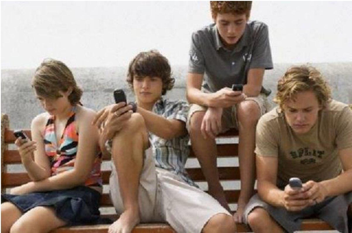
A day at the beach.