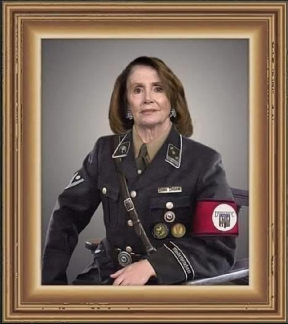
MINISTER OF PROPAGANDA Frau Nancy Pelosi