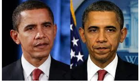
4. Barack Obama, 2013