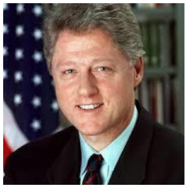
The occasions were: