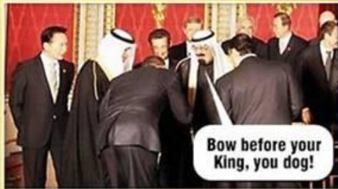
Obama... W T F ?!