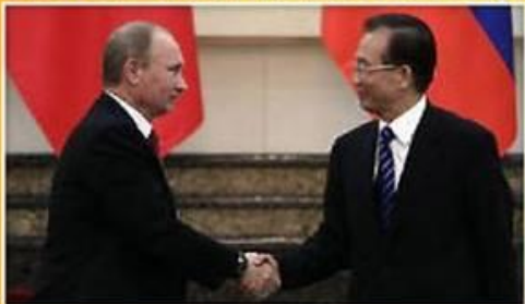
Putin looks China's president in the eye