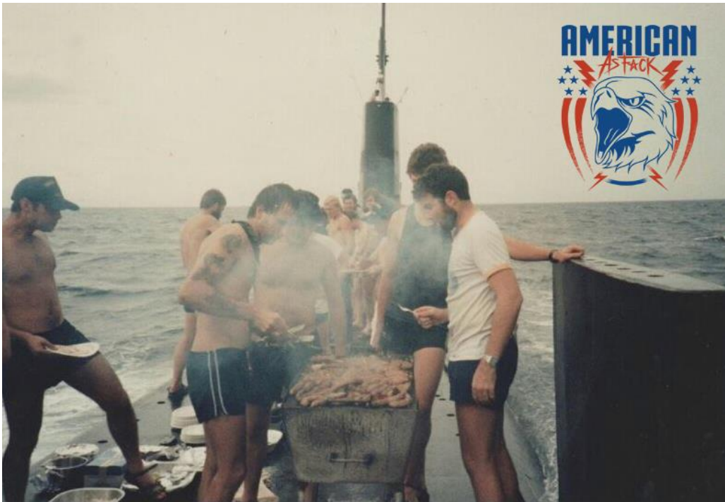
Bar-b-q on a moving submarine