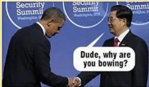
Obama bows like a weak dog