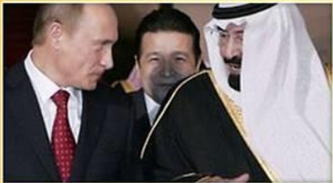
Putin looks the Saudi King in the eye