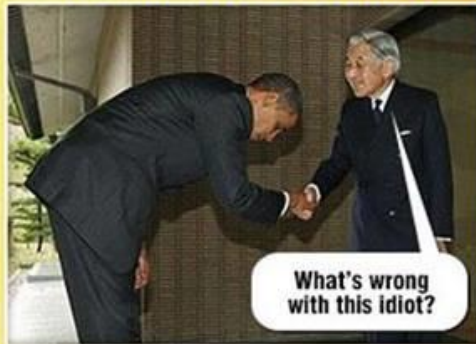
Obama... W T F ?!!!!!!