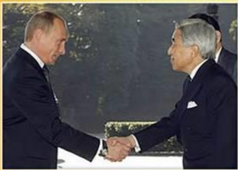
Putin looks Japan's Emperor in the eye